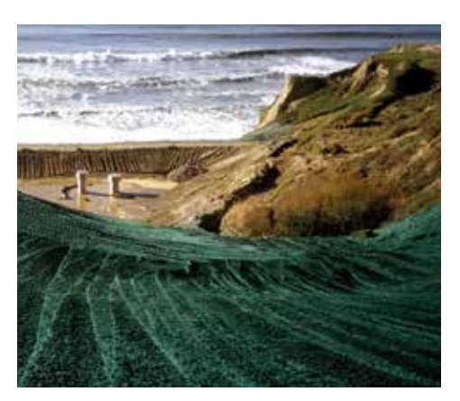
Less expensive than extended term blankets, and less soil preparation is required