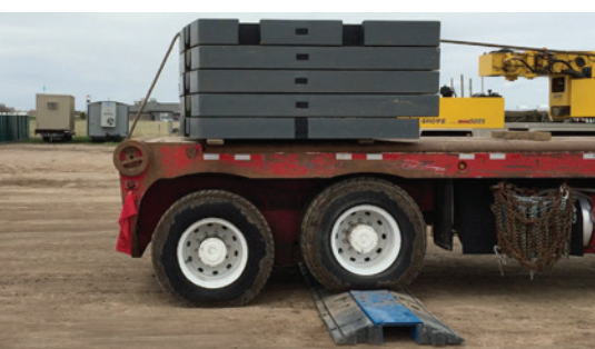
Pipe & Utility Road Crossing