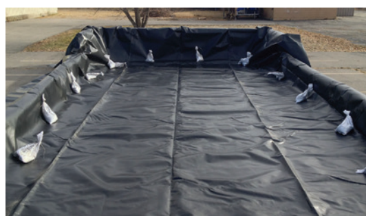
Equipment Spray-off Zone