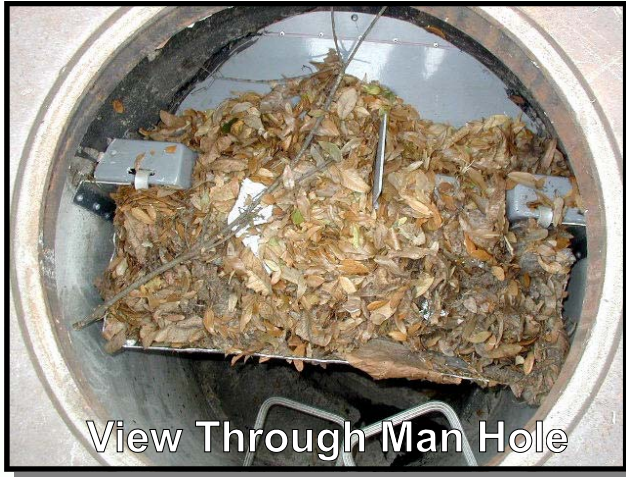
View Through Man Hole

Heavy and Expensive Equipment Is Not Required To Do Service Work