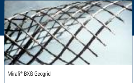
Mirafi® BXG Geogrid

Prepare the ground by removing stumps, boulders, etc. and fill in low spots. Unroll the Mirafi® BXG geogrids directly over the ground to be stabilized. If more than one roll width is required, overlap rolls. Place the aggregate onto previously installed geogrid.