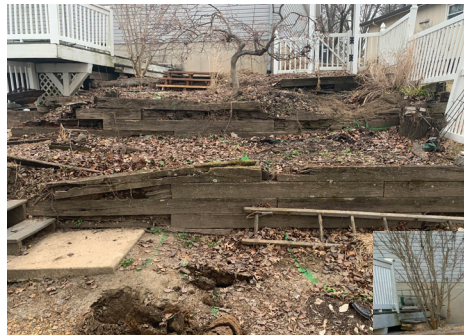
Before & After Transformation Pictures

Check out the pictures from some of our recent projects!