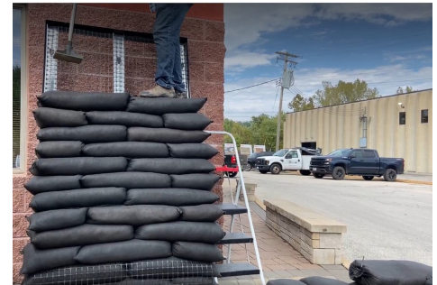
Flex MSE Demo Wall at ASP's St. Louis Office