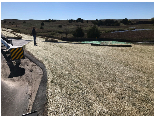
Erosion Control Installation Over ProGanics