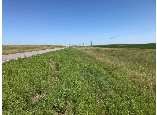
Results 10 Months After Installation of ProGanics and Erosion Control Solutions