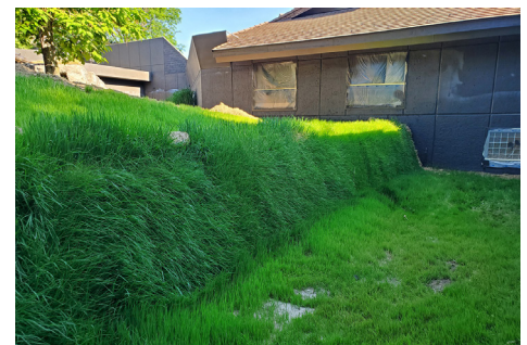
Flex MSE Wall at Henry Doorly Zoo's Gorilla Exhibit