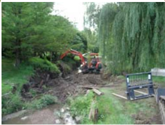
Demolition of existing tie wall.

Project name: Schulte Creek Bank Repair Project location: Auburn Nebraska Products incorporated: CMI-Crane Material Intl. Vinyl Sheet Piling-Shoreguard S325 Purpose of project: Stabilize eroded creek banks Previous repair attempt: Railroad Ties