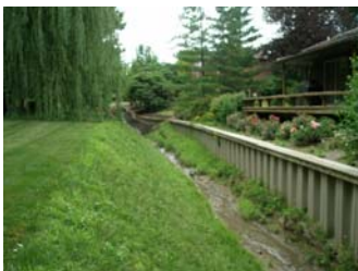
6 months later, the wall has blended in to the landscape.