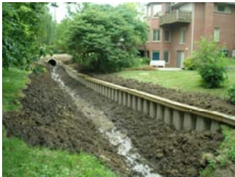
Completion of Vinyl Sheet Pile wall.